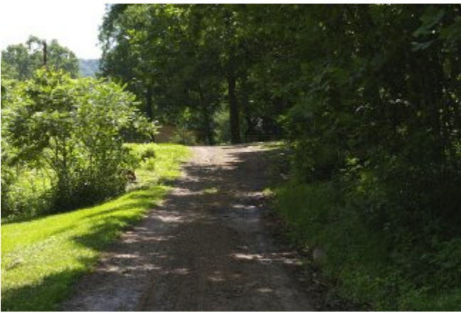
Another small hill...