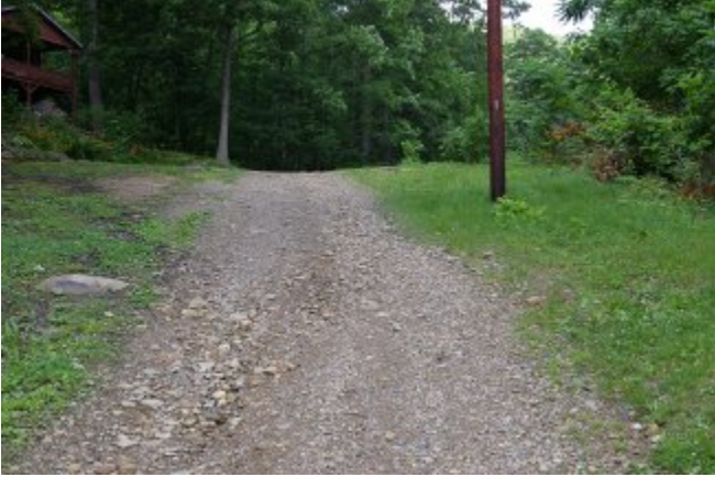
Two short hills.