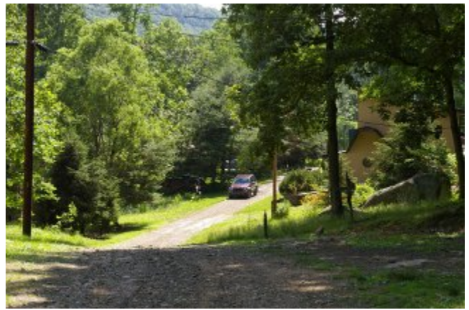
...with a 7% grade down. Slow, rough.