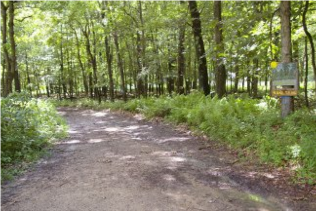
Bare left at the sign.