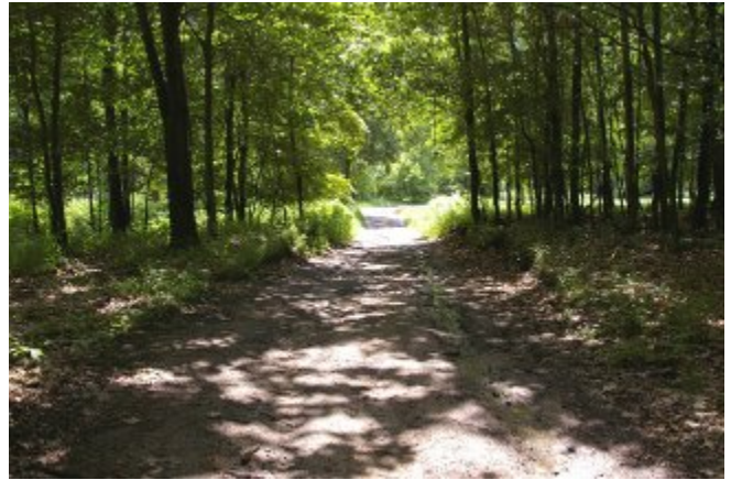
A slight down hill to trail. Caution, sand at bottom