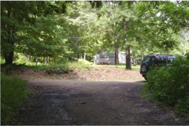
Turn right and continue south.