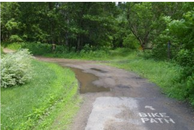
Bare left with a short, slight grade.