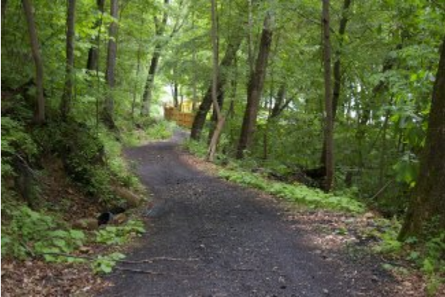
Go slow down grade back to the paved surface. Stay to left of fence.